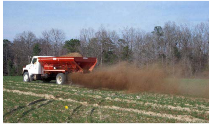
Animal wastes are used widely in agriculture to fertilize crops. Methods for analyzing the nutrients in wastes and predicting their potential availability to plants helps avoid over application and minimize risk to the environment.