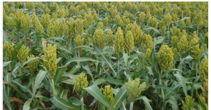
Grain sorghum is an emerging crop in the southeastern U.S., often replacing corn on drought-ridden soils. Farmers need to know the critical levels of micronutrients required for optimum plant growth. Soil tests for sorghum must be calibrated appropriately; however, accurate calibration for a specific crop requires detailed research over many years. Furthermore, as crop varieties change, calibrations must be verified and updated.