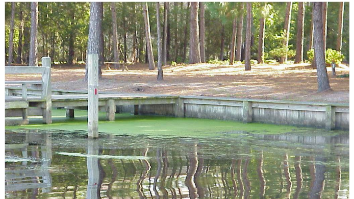
Although originally developed to assess nutrient needs, soil testing methods are now being used to predict and diagnose environmental issues. For example, excess nitrogen and phosphorous in soils can pollute surface waters, causing algal blooms that threaten water quality and aquatic organisms.