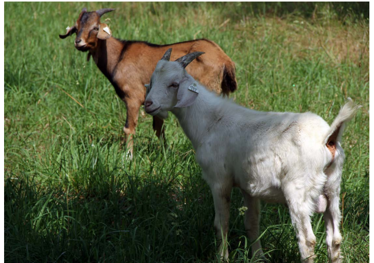
By raising sheep and goats primarily on forage, farmers can reduce feed costs; however, certain plants species are more nutritious than others, and certain breeds of sheep and goats are better suited for foraging.