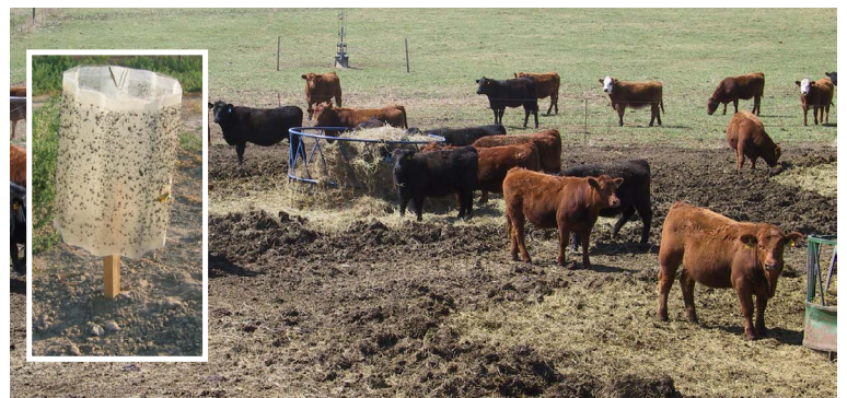
House flies are the most serious nuisance pest associated with dairy and other confined animal operations. S-1030 researchers have determined that insecticide-treated fabric targets (see inset photo) can effectively trap and kill these pest flies when placed around animal facilities and feeding areas.