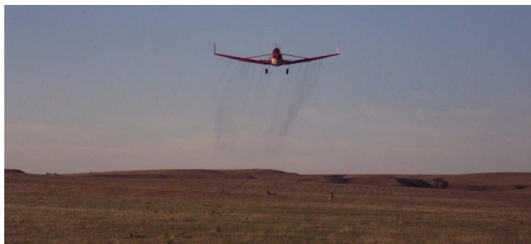
Metarhizium, a pathogen that affects grasshoppers, is applied over fields by aerial sprays (above). The grasshoppers that are exposed to the spray become infected (below).

Insect pests are consistent problems. Federal, state, and industry researchers must work together to create standard guidelines for monitoring insect pests and for determining the long-term effects of using insect diseases as components of integrated pest management systems. Scientists must continue to look at the genetics of insect diseases and track how they spread in order to estimate persistence and effectiveness. Continued collaboration with industrial partners will develop new products and technologies to manage pest problems.