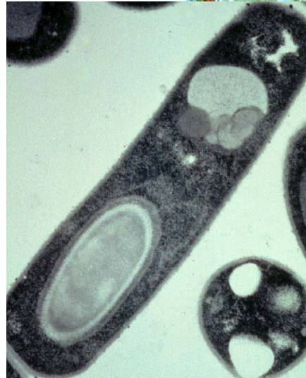
Bt bacterium (left) is a commonly used biological pesticide that has more recently been used in genetically modified crops. The potato tuber worm granulovirus (above) is a pathogen used to control some insect pests.